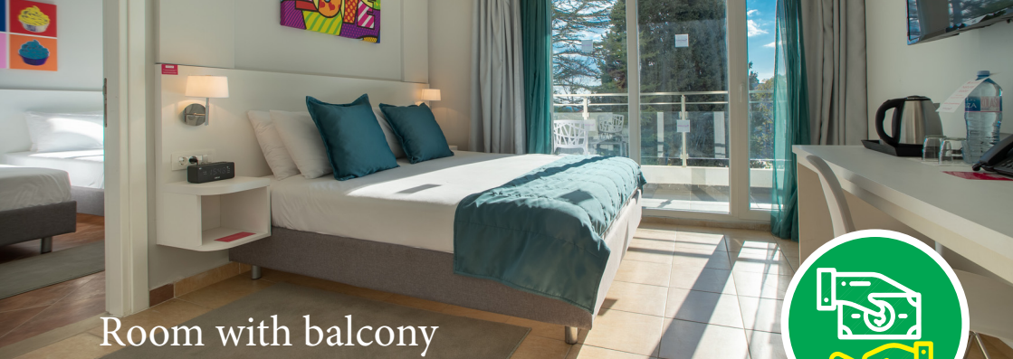
Room with balcony